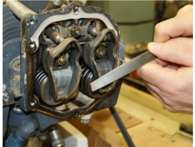
Figure 3 Apply File Across Edge of a Rocker Arm Installed on the Engine