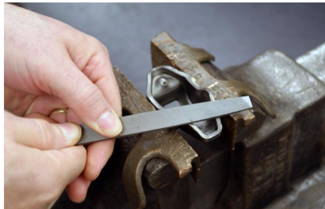
Figure 1 Apply File Across Edge of a Rocker Arm

NOTICE: If the rocker arm is not hardened, it will have a feel similar to filing aluminum or any soft metal. File shavings are also an indication of a non-compliant rocker arm.