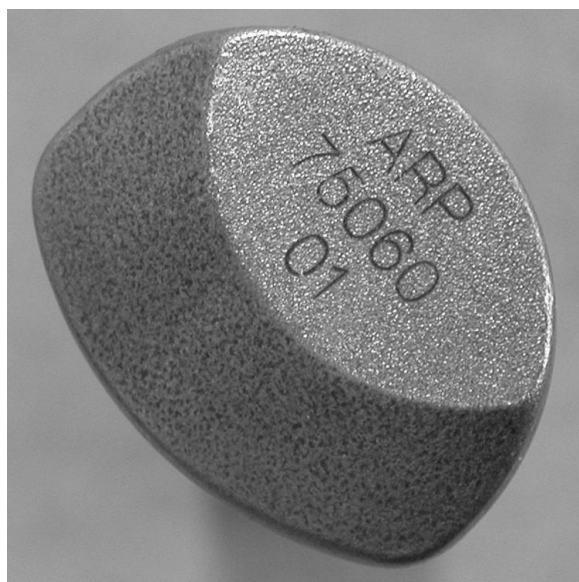
Figure 1. Variant Connecting Rod Bolt Part Number Marking

This Service Letter is a notice that recent lots of connecting rod bolts P/N 75060 have a variant marking of the part number on the bolt head as shown in Figure 1. Figure 2 shows the typical marking. The bolt with the variant marking (in Figure 1) can still be used. It will not change measurements for stretch applications. The part number marking in Figure 1 does not change form, fit or function.