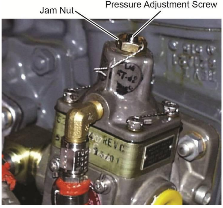
Figure 1 Pressure Adjustment Screw with Jam Nut

Figures 1 and 2 show two different styles of pressure adjustment screws on AN-drive type fuel pumps.